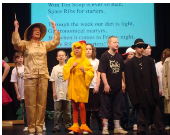
Rothesay Primary School present the Pantomime Jack the Musical. Rothesay Academy School Band, underlining the benefits of a 3-18 Joint Campus, accompanied the cast.

The Christmas Pantomime, Jack, celebrated the exceptional talent of staff and pupils. This production was based on teamwork and engagement with the local community. The Primary 7 Talent Show and Deal or No Deal evening, run by the PTA, was an enjoyable family event. Annual events such as our Hallowe'en and Valentine discos were a great success and thoroughly enjoyed by all who attended. Our end of session whole school concert celebrated Scottish culture in our Homecoming Year – another success, which was enjoyed by everyone.